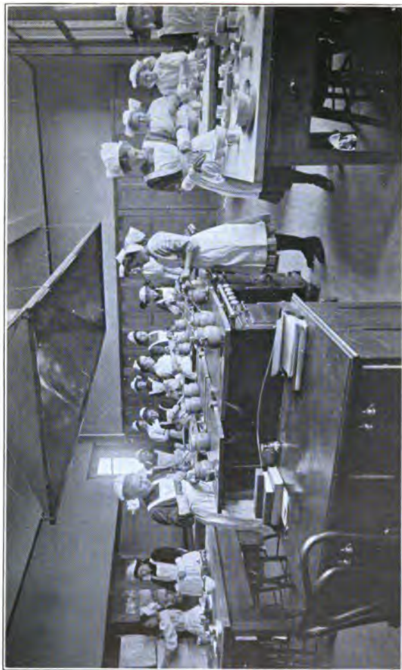
New type of equipment in use in schools such as Eagle and Mound